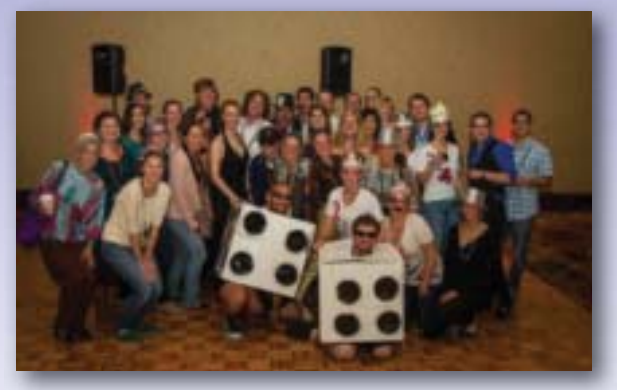
Immunology graduate students dressed to kill for the "Casino night" dinner celebration, held the first night of the CIC