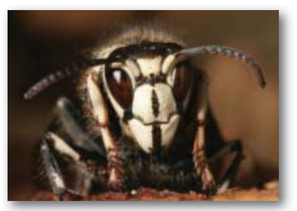
Anterior view of a bald-faced hornet, Dolichovespula maculata

The group at Hopkins published the results of a single-blind controlled trial on venom therapy in 1978.<sup>33</sup> They divided 60 patients into three groups, treating the first with venom, the second with whole-body extract,