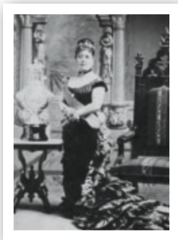
Queen Emma, ca. 1880