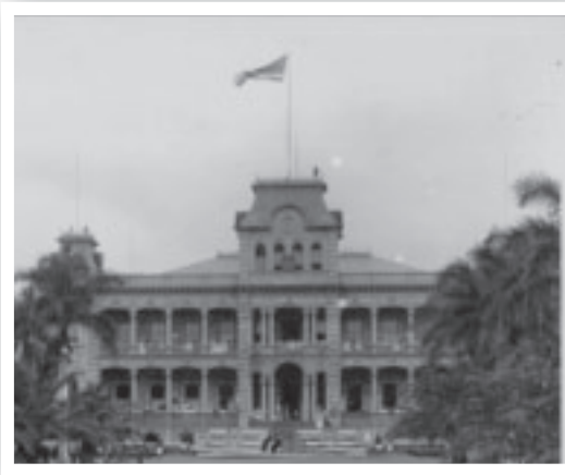
‘Iolani Palace, 1898