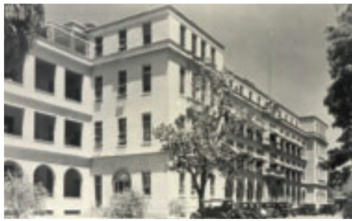
Queen's Hospital, ca. 1925