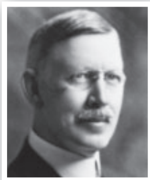
Archibald N. Sinclair, ca. 1927