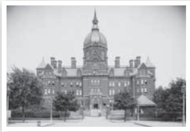
The Johns Hopkins Hospital, ca. 1910

Already, at the outset of hostilities in Europe, U.S. Surgeon General William C. Gorgas was concerned with enlisting enough qualified physicians in the Army MRC to ensure military preparedness. One of the first physicians he solicited was his grandnephew Stanhope Bayne-Jones. When “Uncle Willie” 10 wrote his nephew in the summer of 1915, Bayne-Jones was just beginning his career at Johns Hopkins. 11