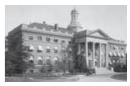
Walter Reed General Hospital, ca. 1915