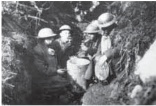
American soldiers in the trenches, ca. 1918