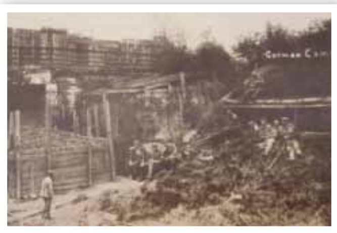
German trench, ca. 1918