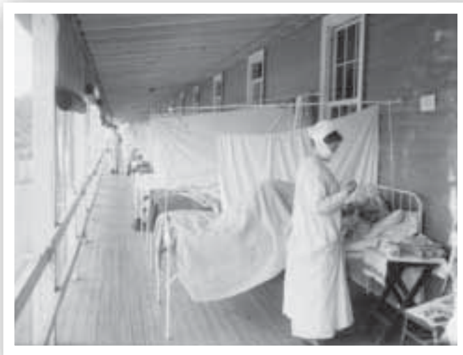
Flu ward, ca. 1918