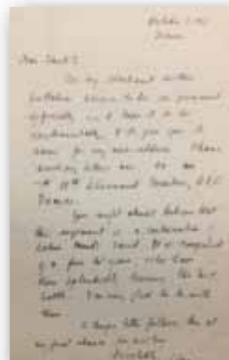
Letter home, ca. 1917 National Library of Medicine, Stanhope Bayne-Jones Papers