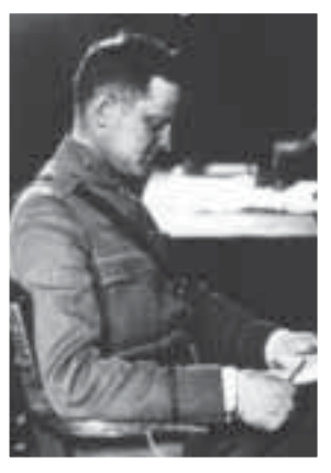
Hans Zinsser

work shorthanded in the school during the war or restless because they were in Europe during the war. Even the men who were in the Hopkins unit in France and have been back here since February are not yet settled into their work—or their feelings.” 49