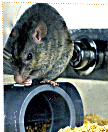
Jim Weed, NIH Division of Veterinary Resources

The most important thing is that the research must be relevant to human or animal health. Studies need to protect the animals’ welfare. That means that only the fewest number of the most appropriate species may be used. Under federal law, all animals must be treated humanely and undergo the least distress possible.