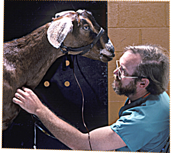
NIH Medical Arts

Veterinarians with specialized training in laboratory animal medicine are an integral part of a medical research team. As part of this research group, veterinarians assure the humane treatment of animals and provide medical and surgical support throughout research studies. Emergency veterinary care for research animals is available on a 24-hour basis.