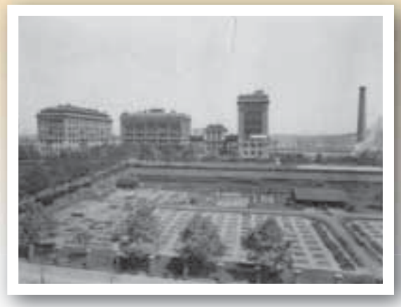
Rockefeller Institute for Medical Research, c. 1925

After completing her doctorate in bacteriology in 1925, Lancefield returned to her research on hemolytic