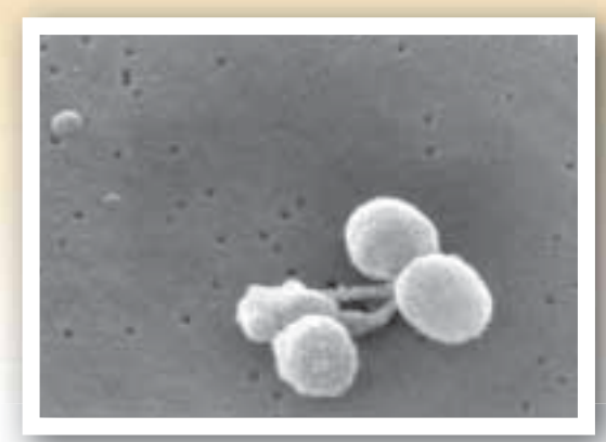
Streptococcus pneumonia

After receiving and testing streptococcal strains from human and animal subjects across the country, she soon realized that the antigen she believed to be species-specific was actually group-specific. This differentiation in group provided the basis for her classification system and the study of streptococcal diseases. Lancefield did not publish her results as the M-protein and C-carbohydrate discoveries were made. She did, however, author a series of five articles in 1928 reporting these discoveries.26