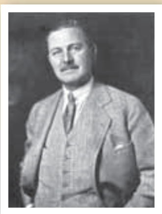
Oswald Avery, ca. 1929