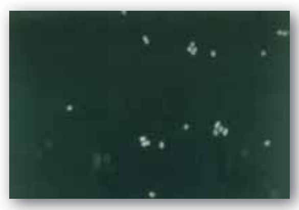
Pneumococcus